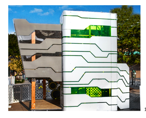
Figure 8: Fairytale Rendering Figure 9: Fairytale Fabrication Figure 10: Toy Factory Rendering Figure 11: Toy Factory Fabrication