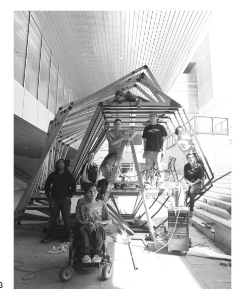
Figure 1: Collaborative Studio Figure 2: Toy Factory Team Figure 3: Fairytale Team

teams they ultimately struggle with the hierarchical order which manifests in personality conflicts. This studio attempted to diminish the idea that any one singular person was responsible for any one singular design aspect. In order to test these two theories students never worked individually and the timeline for research on a team project was cut in half of what it should typically take. In the case of their first assignment they were given three weeks to produce a body of research that should normally take six weeks.